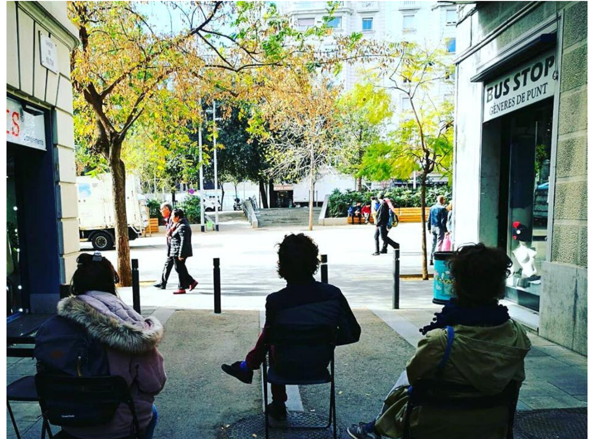
THE OBSERVED STREET: street with three pedestrian lanes and the possibility of cutting one car-lane.