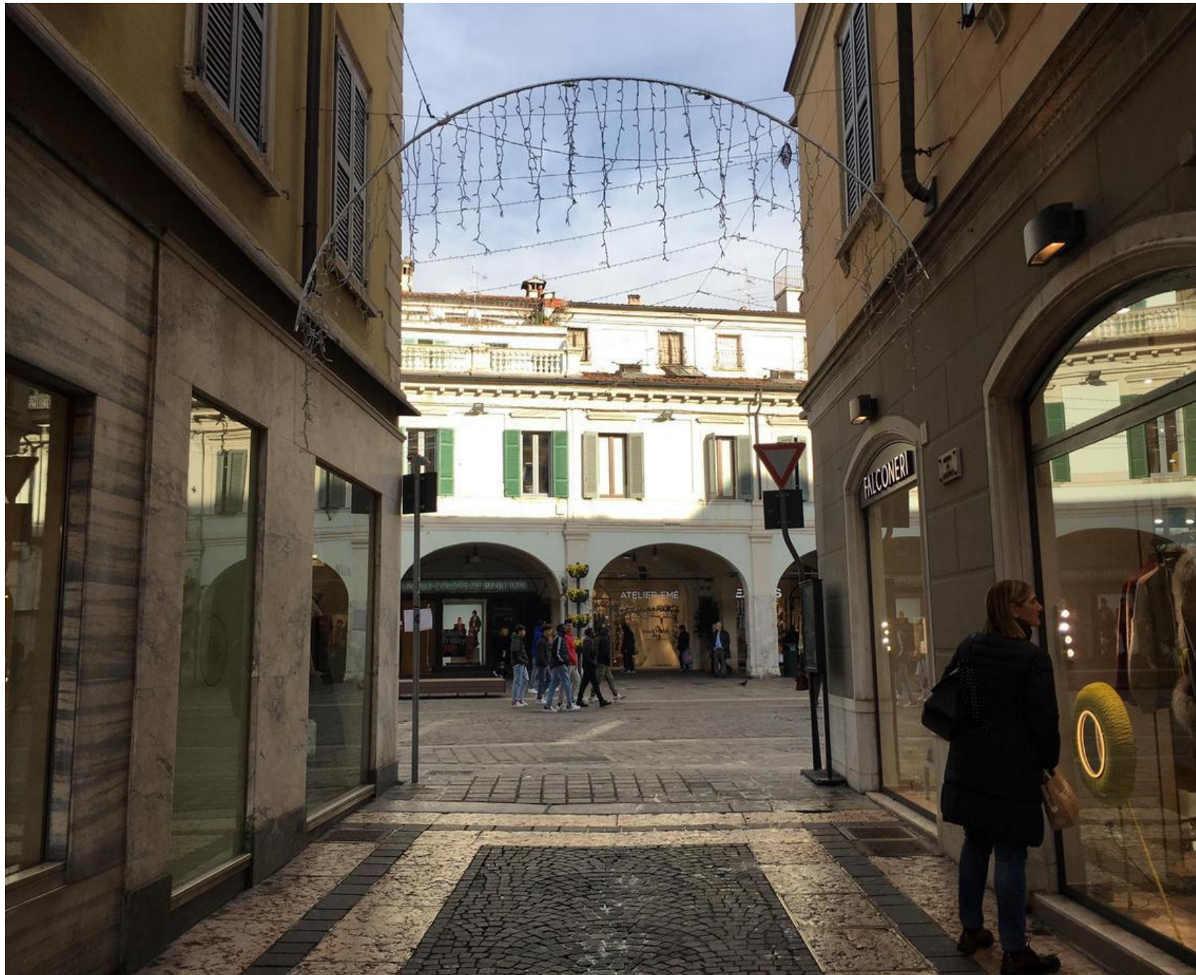
THE OBSERVED STREET: pedestrian or semi-pedestrian commercial area without too much profundity