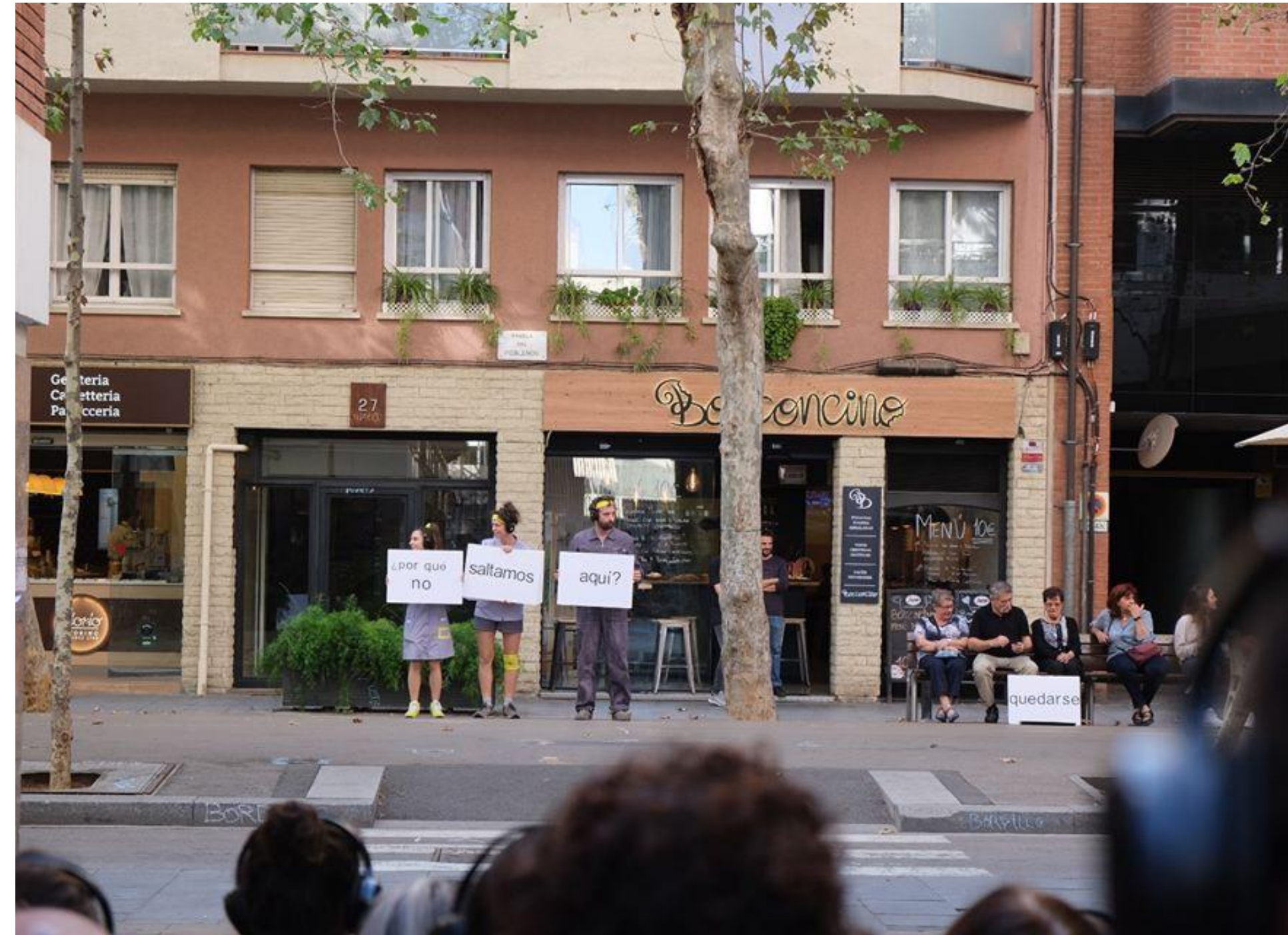
THE OBSERVED STREET: rambla with three pedestrian lanes where people walk, shop, roll by...